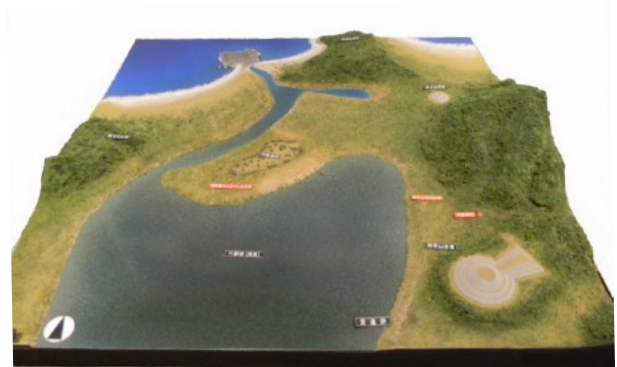
Image1: Takano-gata – lagoon and tumulus, 5th Century

Since ancient times, cinnabar has been mined in Kyotango and painted on ancient burial mounds and earthenware. In this region, textile was dyed with Akane (Japanese madder) in vermilion. Vermillion used to have the meaning of talisman against evil because it reminded us of the sun and blood and, Japanese flag is dyed in madder. For the special exhibition “ECHO TOMORROW FIELD – Food and Art,” contemporary artists will create and presents crafts, designs and artworks Inspired by vermillion in Tango.