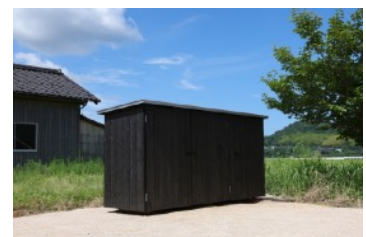
Image3: Smoked cedar store house by Office of Ryue Nishizawa, 2022

After giving much thought to the motives lie at the foundation of art-making, the conclusion reached was “prayer” and the meaning of cemeteries. This project will present perspectives from the fields of architecture, nature, craft and art that question the meaning of art in the imagination of the visitor to the shrine and that we hope will be connected to the idea of prayer in the present.