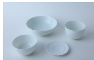
Image15: "Four Bowls" Akio Niisato

TOMORROW FIELD SHOP | https://tomorrowfield.stores.jp/