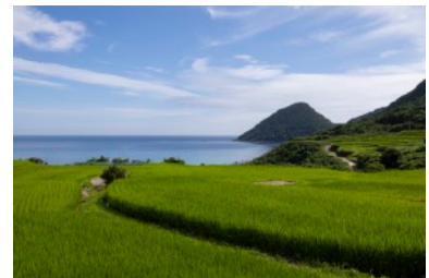
Image16: Sodeshi Rice Terraces