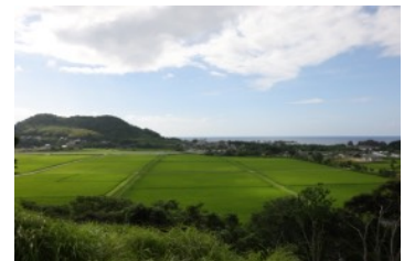
Image2: Village of Taiza and Takano-gata, 2022