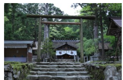
Image17: Moto Ise Naiku Kotai Shrine, Fukuchiyama