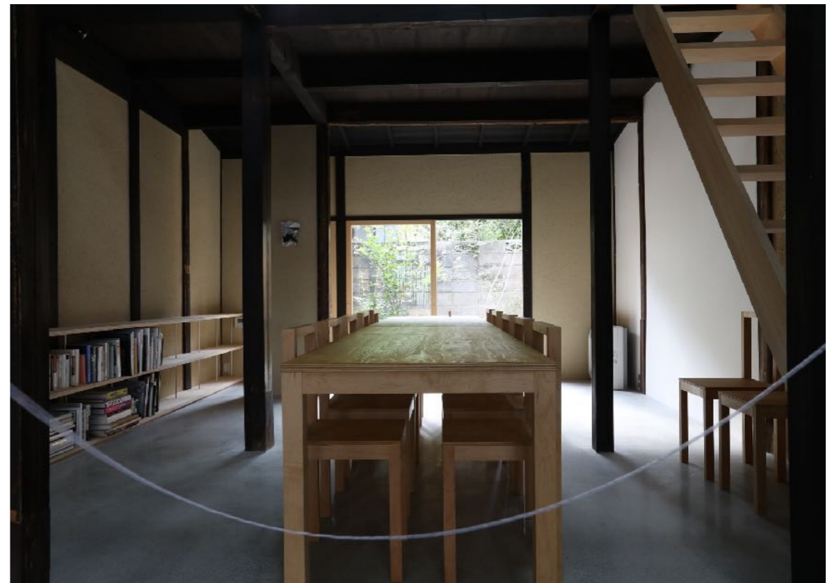
卅 | SEI (Kyoto City)