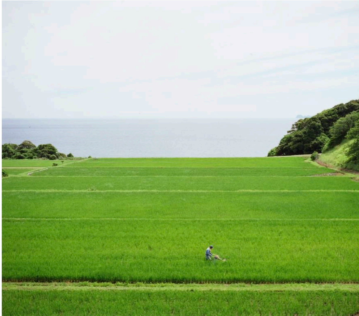
Nii Rice Terraces