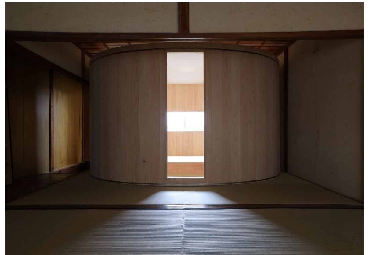
Shuji Nakagawa "Wooden Room", 2022