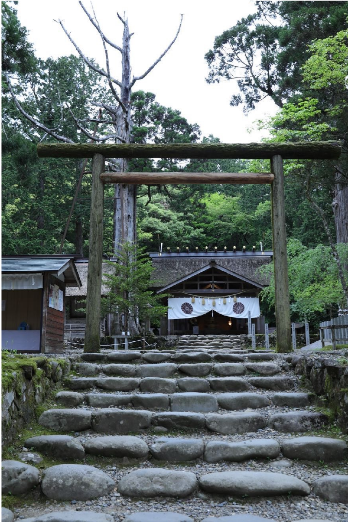
Motoise Imperial Shrine