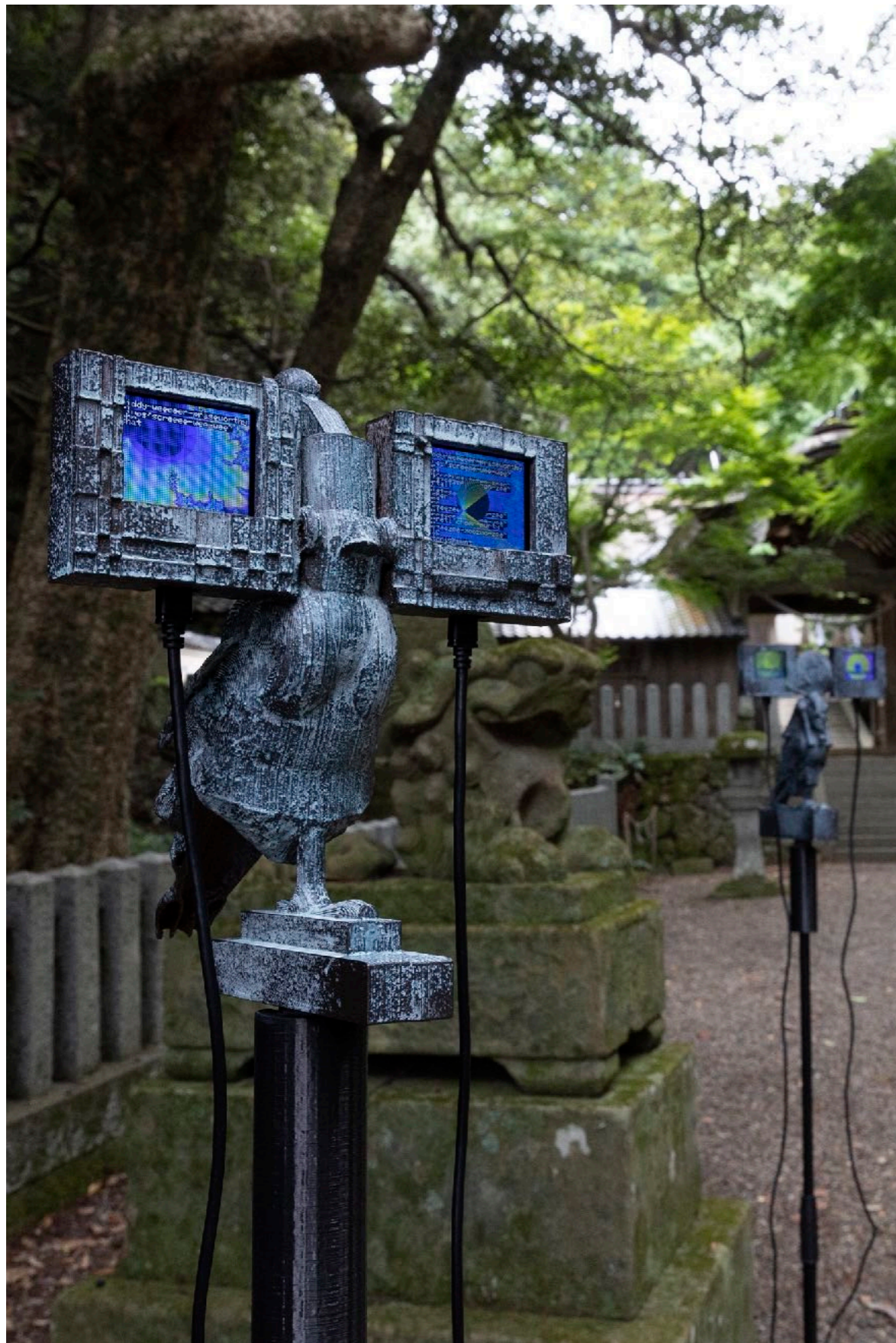
Samson Young "The Messengers", 2022