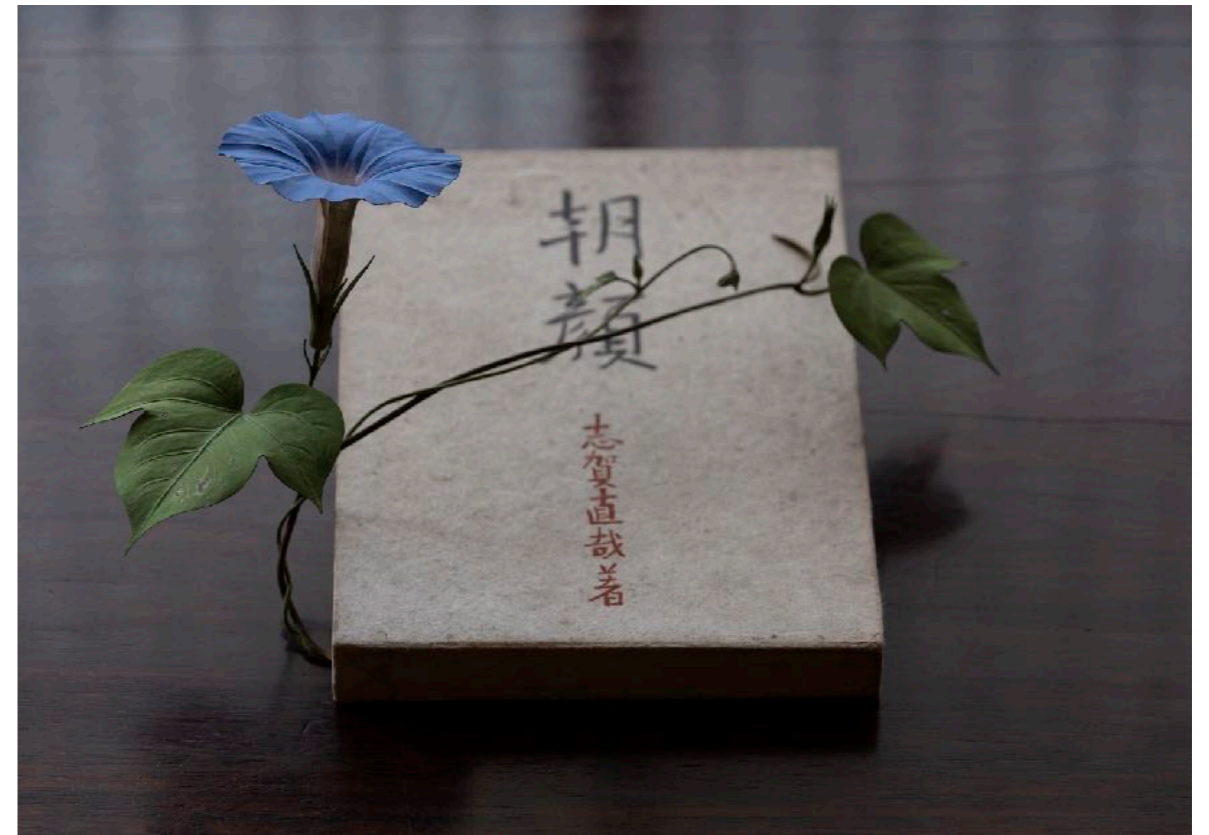
Yoshihiro Suda "Morning Glory", 2022