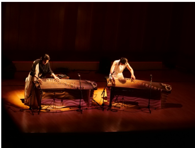
LEO performance at "GRID ON //GRID OFF" 2023

Artist Website: https://www.leokonno.com