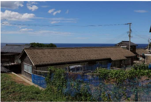
SEI TAIZA