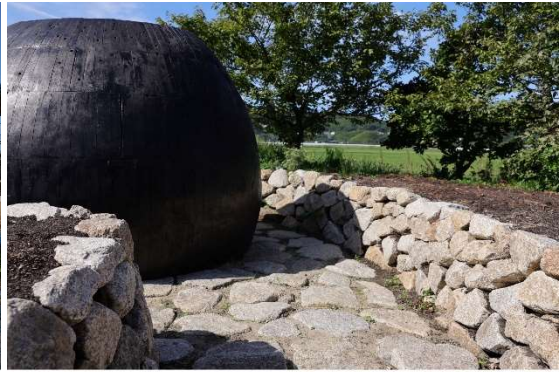
Field of Stars

TOMORROW creates sustainable living spaces using local construction methods, materials, and contemporary thinking and techniques -