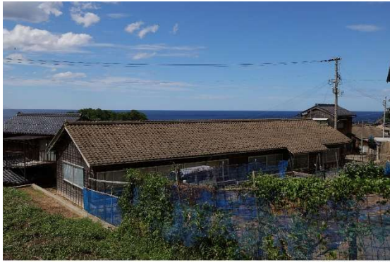
SEI TAIZA

October 25, 2024–November 17, 2024 | VENUE: Taiza, Kyotango