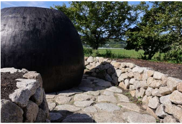
Field of Stars