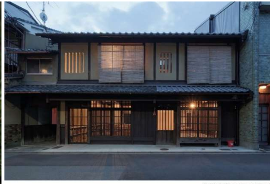
SEI KYOTO