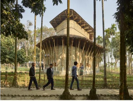
Anandaley outside.