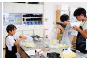
Taiza Children's Cooking Class “Tomorrow's Kitchen - Fermentation”