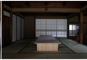
Shuji Nakagawa “Table”, 2021