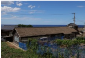
SEI TAIZA 2023-

A 60-year-old building used as a Tango Chirimen factory is being repurposed as the first art gallery in Taiza to explore new possibilities for textiles.