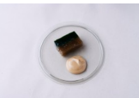
SEI-kitchen vol.7 “Sustainable Fashion and Sea Sweets”