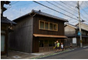
TAIZA Studio 2020-

Experimental houses that create sustainable living spaces, now and in the future, using local construction methods and materials and contemporary thinking and techniques. New attempts to link architecture and crafts, such as the “Wooden Room” by Shuji Nakagawa, are being undertaken.