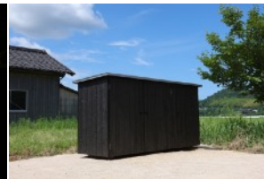
“Smoked Cedar Store House”, 2022 Supervision: Ryue Nishizawa Architects