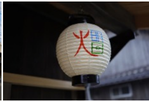
Hiroshi Sugimoto “TOMORROW FIELD” logo, 2021