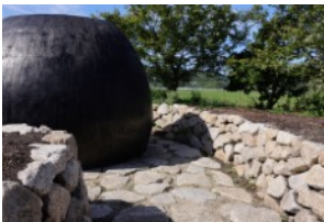
“Field of Stars”, 2023