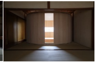
Shuji Nakagawa “Wooden Room”, 2022