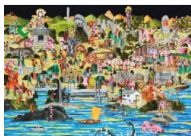
Sangho Noh “THE GREAT CHAPBOOK 3 - Taiza”, 2024, SEI TAIZA

Illustrations: Sangho Noh drawings, and more.