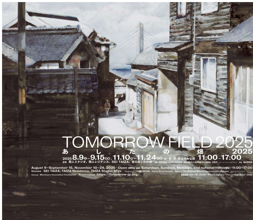
Painting: Misato Ogiwara "The Liminal Road" 2025, Design: Cozfish