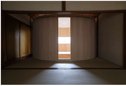
Shuji Nakagawa, Wooden Room, 2022