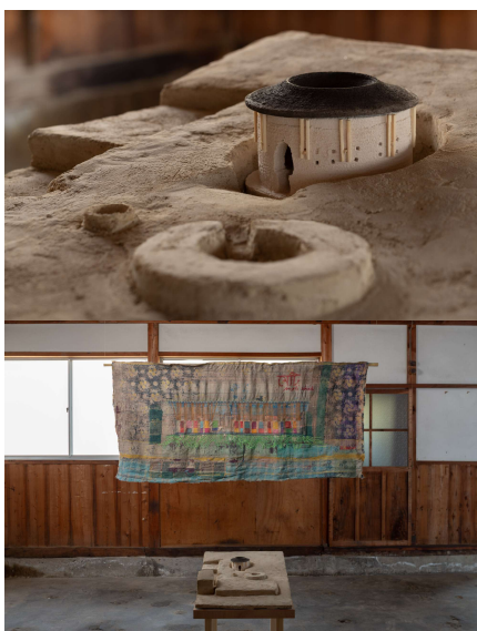
MIYA Tea House model, 2025

Aiming for completion in 2026, several hands-on workshops are scheduled, inviting local residents and students to learn the rammed earth technique . Through these shared experiences, the project will further explore the possibility of architecture built in harmony with nature, as well as co-creating new community spaces centered around Food and Art.