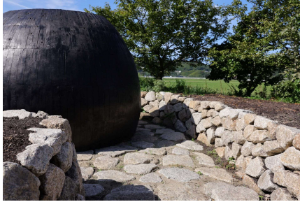
Field of Stars, 2023

An experimental house that embraces living space for the present and future. It reimagines sustainable living using local building techniques and materials, combined with contemporary ideas and craftsmanship. One of its highlights is the “ Wooden Room ” by woodworker Shuji Nakagawa . The studio explores new possibilities of integrating architecture and craft.